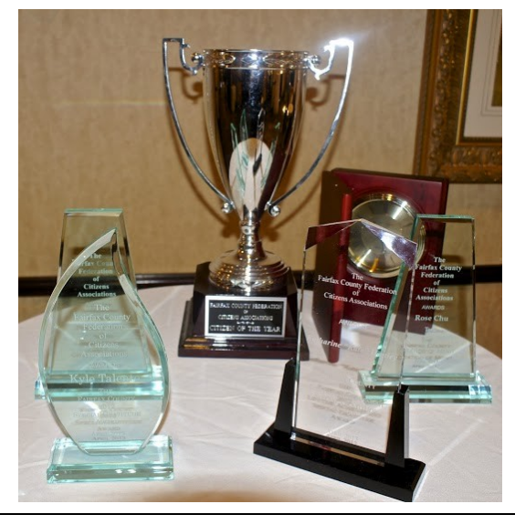
Clockwise from left: Special Gratitude Award, Citation of Merit, Federation Cup for Citizen of the Year, Citizen of the Year Clock for 2011 honoree, Citation of Merit, and Lifetime Achievement Award

More banquet pictures will be posted on the Federation's website at <a href="https://www.fairfaxfederation.org">www.fairfaxfederation.org</a> and on Facebook at Fairfax Federation. Thank you for making the Sixty-Third Citizen of the Year Banquet a very special evening for our honorees.